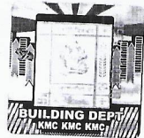
Asst Engg/Executive Engg by order (Municipal Commissioner) Executive Engineer (Civil) Building Department / Borough-X The Kolkata Municipal Corporation

(Signature and designation of the Officer to whom powers have been delegated)